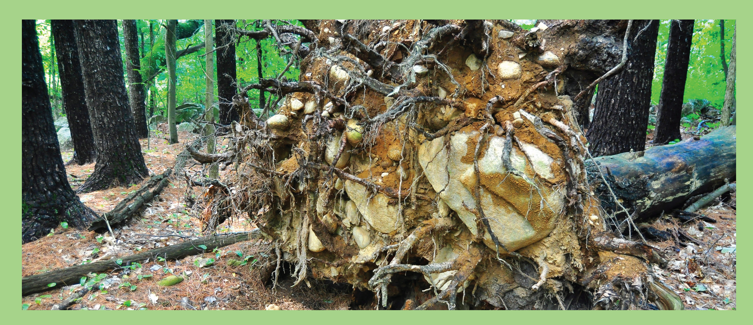
An overturned tree along the trail. Within the roots you can see the different colored soils including the orange-brown subsoil.