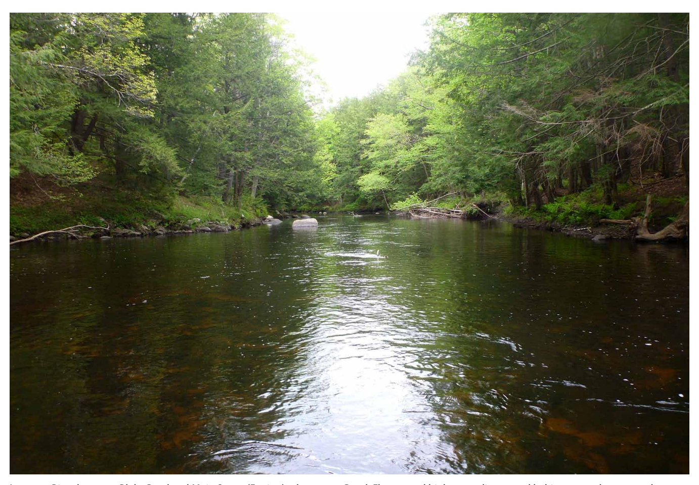
Lamprey River between Blake Road and Main Street (Epping) where most Brook Floater, and highest quality mussel habitat, were documented.