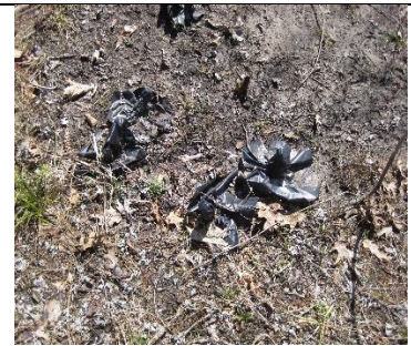
bagged buckthorn stumps at the Lee Public Canoe Access