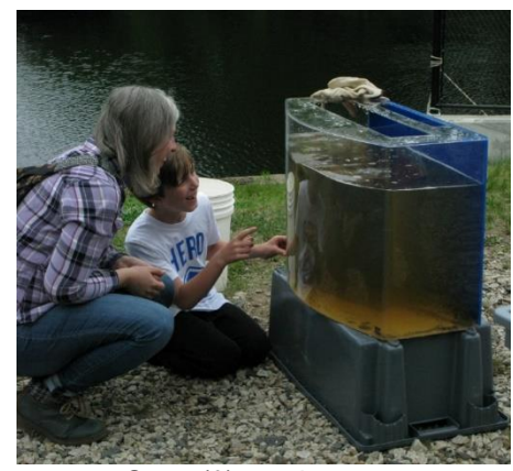
Scary(?) sea lamprey

Free parking is available along Route 108 and behind the Newmarket Public Library. Follow the fish signs to the top of the fish ladder.