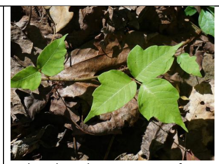
poison ivy