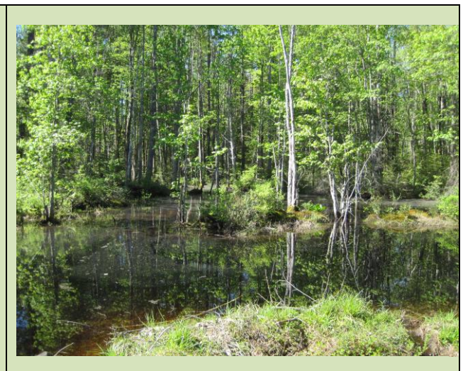
Visitors at the grand opening in May enjoyed seeing this beautiful vernal pool, formerly a heavily damaged ATV trail.