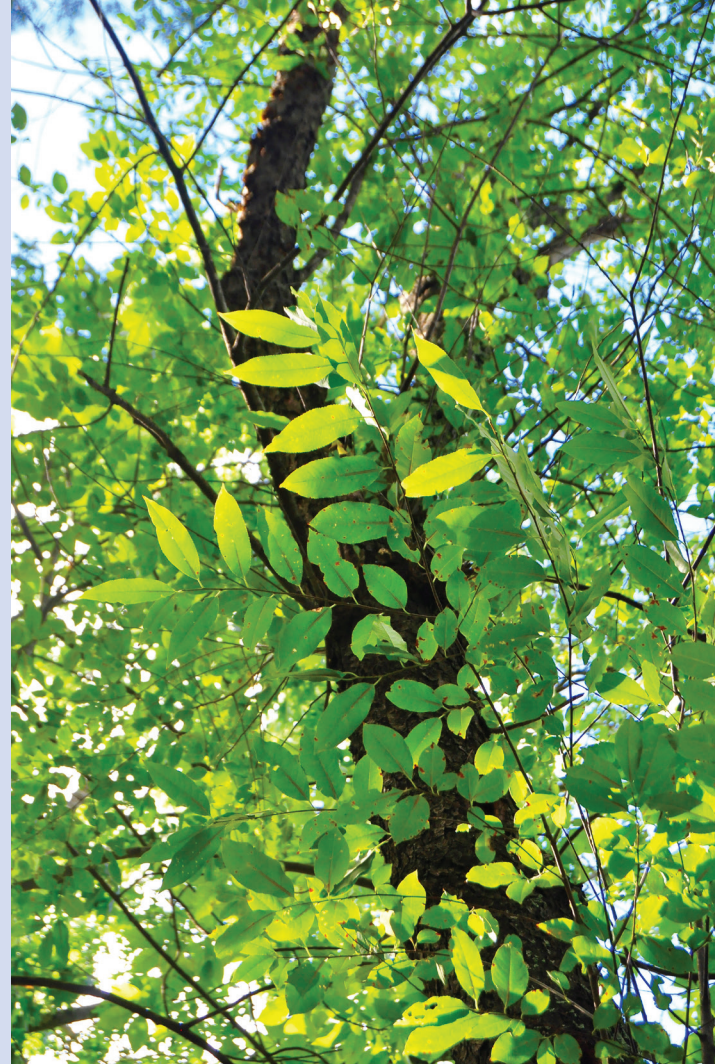
Examples of bark and leaves from a black cherry tree.

http://extension.unh.edu/resources/files/resource000980_rep1106.pdf https://plants.usda.gov/ https://www.nwf.org/ http://www.adirondackvic.org/Trees-of-the-Adirondacks-Black-Cherry-Prunus-serotina.html