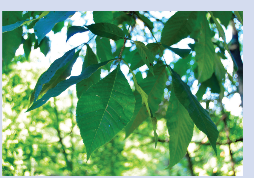
Examples of bark and leaves from a shagbark hickory tree.