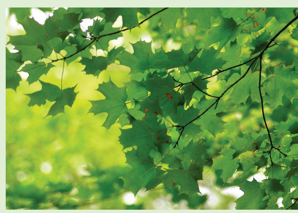
Examples of bark and leaves from a sugar maple tree.