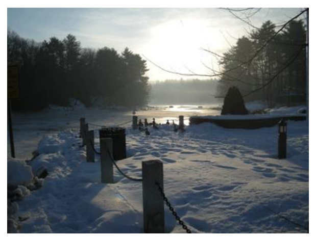
Chilly Schanda Park in Newmarket

Most of the 49-mile Lamprey River is freshwater, but the 2-mile section from Macallen Dam in Newmarket out to Great Bay is saltwater. Twice a day, this water rises and falls with the tides. This rhythm occurs even with a covering of ice. As ice expands with the incoming tide and constricts with the outgoing tide, it cracks and contorts. This action does not happen silently. The sound waves travel through air and water as usual, but they are distorted when they travel through ice. The result is a symphony of eerie and spacy sounds consisting of creaks, groans, pings, pops, rumbles,