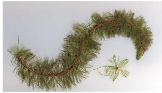
variable milfoil stem and cross section

Pawtuckaway Lake empties into the Lamprey River in Nottingham. Problems in the lake can easily become problems in the river. Variable milfoil is one of those potential problems; it grows and spreads quickly. Left unchecked, it can overtake a body of water, ruining its water quality and recreational appeal. In 2014, variable milfoil plants were found in the lake.