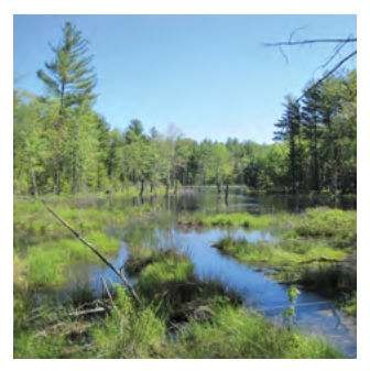
The beaver pond at the Mast Road Natural Area in Epping. S. PETERSEN

south/Exeter Road. Turn left onto Mast Road. Entrance is on the left shortly after Star Speedway.