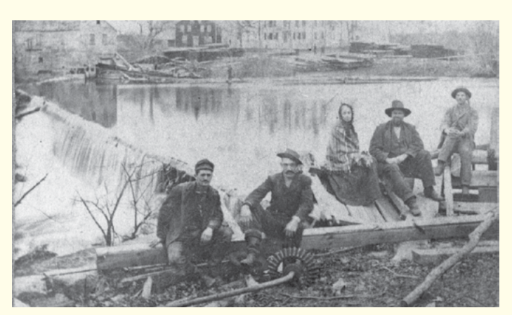
Historic Wadleigh Falls circa 1900.