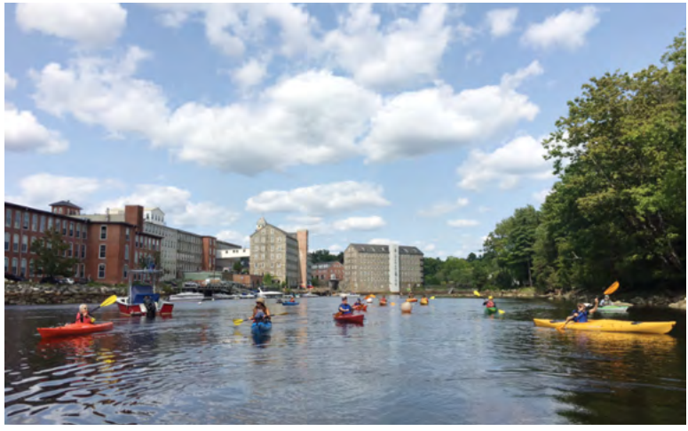
Paddlers enjoy Newmarket's historic mills that were once powered by the Lamprey River.

Newmarket was incorporated in 1727 and was called Lampreyville for a time. Textile mills were a prominent feature of Newmarket in the 1800s and the Newmarket Manufacturing Company built and controlled dams as far away as Northwood to provide water power for the industries and town. Many of the historic mill buildings have been converted to modern uses such as apartments and small businesses.