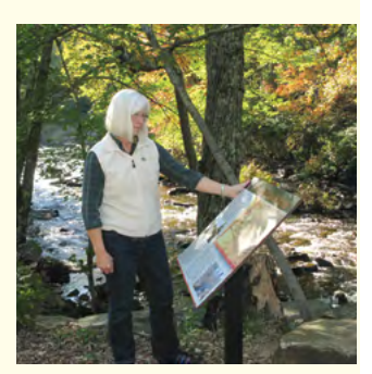
A visitor learns about history at Mary Blair Park in Epping.

Kiosks at many sites describe the history of use at each site and also of the towns in general. These will take you through time from the Native Americans, to the early settlers and the remains of their mill buildings, to the present day. Much of downtown Newmarket, with its large mill buildings, is listed in the National Register of Historic Places.