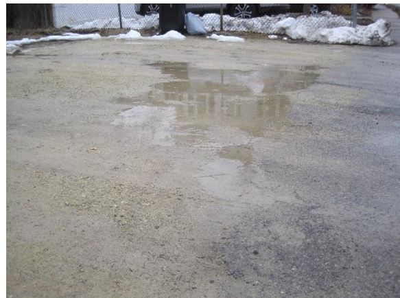
Streets and dirt driveways do not let rain soak in.