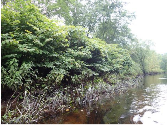
Typical patch of knotweed along a river.