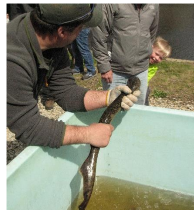
Scary(?) sea lamprey

Free parking is available along Route 108 and behind the Newmarket Public Library. Follow the fish signs to the top of the fish ladder.