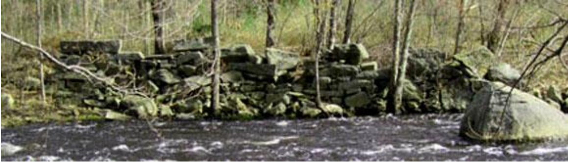
Remains of the Folsom Mill in Epping.

To view panels from the Folsom Mills trail, please click here . Panels are copyrighted by the Epping Historical Society and are used by permission.