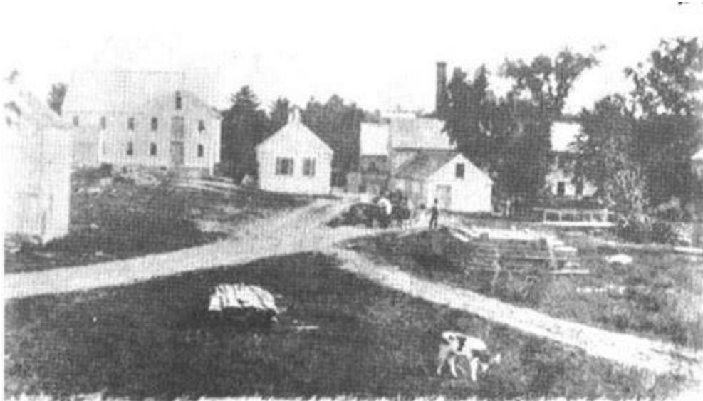
Mill at Wiswall Dam

The mill complex at Wiswall's Falls in Durham was originally constructed in 1835, when brothers Moses and Issachar Wiggins built a wooden dam and sawmill on the river. Recognizing that water wheels were no longer the technology of choice, they installed turbines that more efficiently captured the flow of water. They built other small mills on the site to take advantage of the abundant water power. Over the years, the mills here produced many goods: lumber for buildings and ships, flour, gingham cloth, knives, hoes and pitch forks, wooden measures, nuts and bolts, bobbins, axe handles, carriages and sleighs, chairs, and matches.